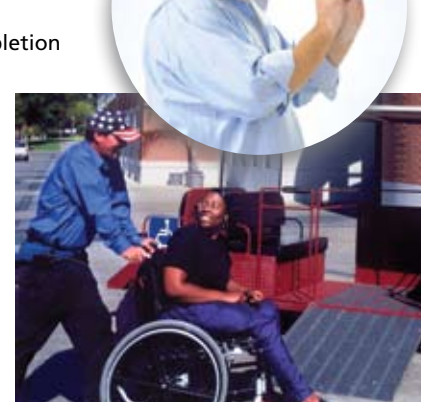
Sign language and transportation services

Some students mistakenly think that this office only serves those with obvious physical disabilities. Actually there are many students who struggle with learning challenges