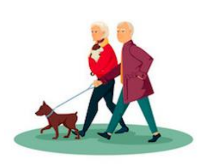
walking the dog