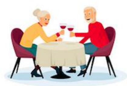
having a glass of wine