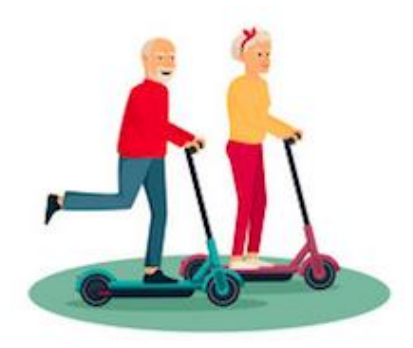
riding a scooter