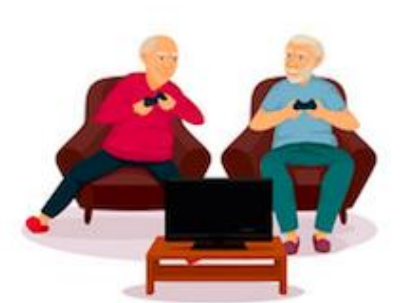
playing video games