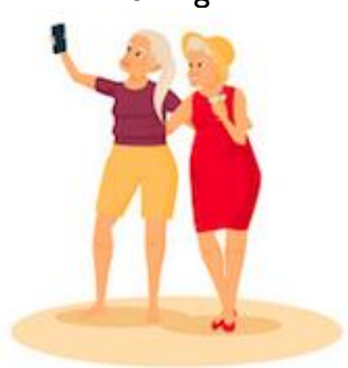
taking a selfie