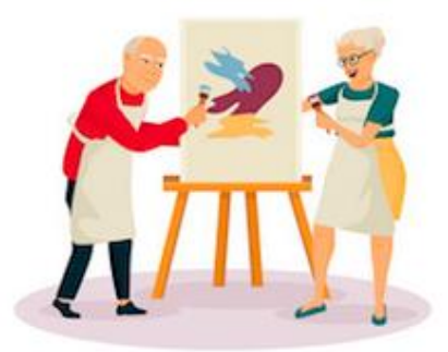
painting a picture Picture Group 2 Questions and Answers: