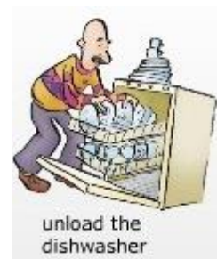
unload the dishwasher