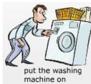
put the washing machine on