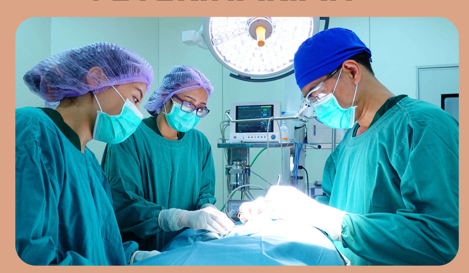
Salary*: $99,250 per year