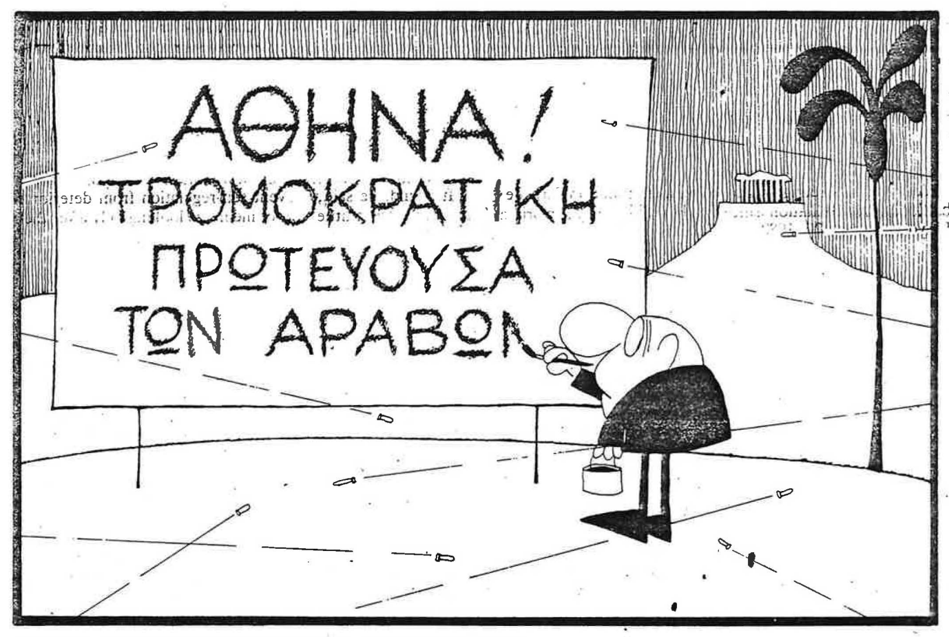
Athens, Terrorist Capital of the Arab World.