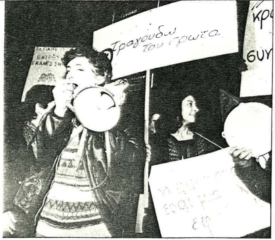
Women's organizations prepare to march on the Ministry of Jusitice

cept that we have the right to decide if and when and how many children we want."