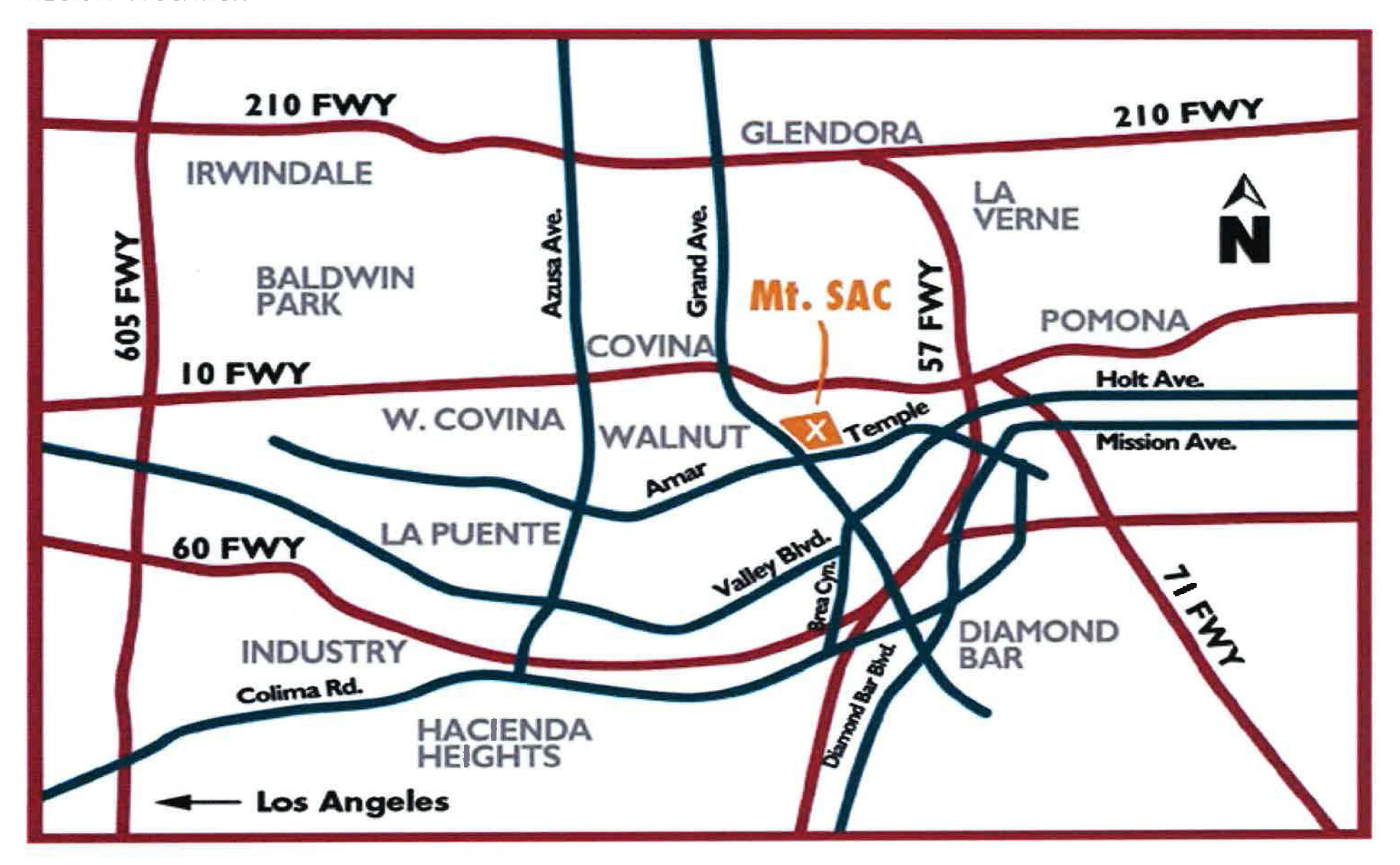
Exhibit 1 REGIONAL LOCATION