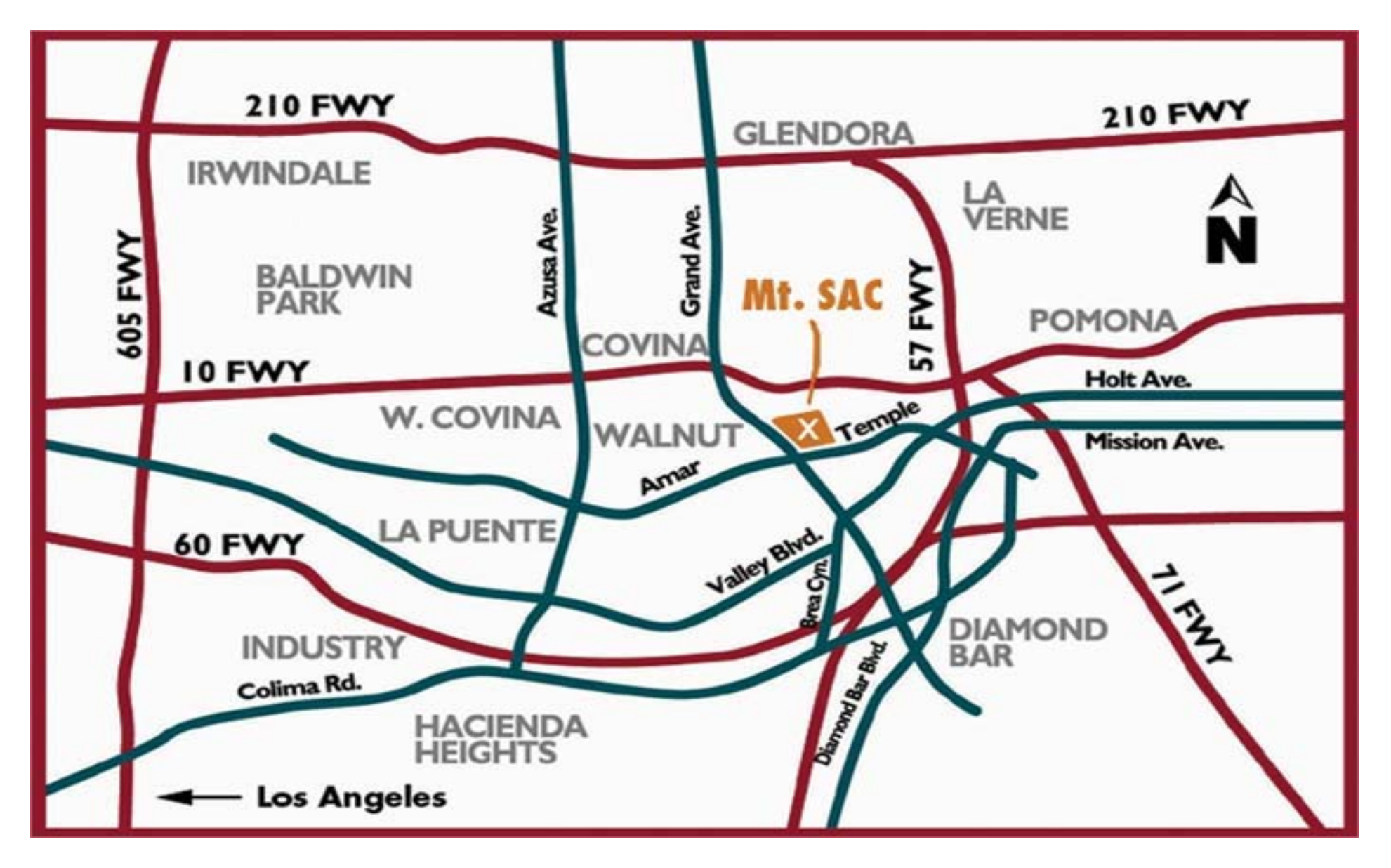
Exhibit 1 REGIONAL LOCATION