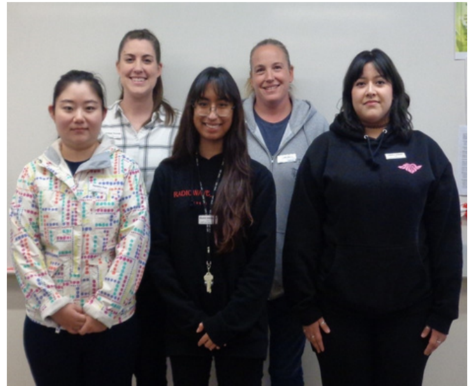
Child Laboratory Students Smiling

The Child Observation Laboratory team dynamically coordinates with all elements of its 3-part collaborative to comprehensively support CDE students. For instance, maintaining ongoing open communication between CDE faculty and CDC staff enables Lab staff to ensure that student's academic needs and CDE course objectives are met within the Lab in accordance with childcare licensing parameters set forth by the State. Additionally, the Lab staff facilitates live and prerecorded observations that enable faculty and CDC staff to evaluate and train practicum and fieldwork students, apprentices, and current CDC employees. Doing so ensures a safe and developmentally appropriate environment for children to grow, learn, and thrive alongside emerging and evolving early childhood professionals.